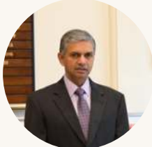
H.E. P Kumaran High Commissioner of India to Singapore