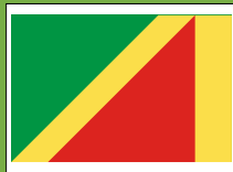
Republic of Congo